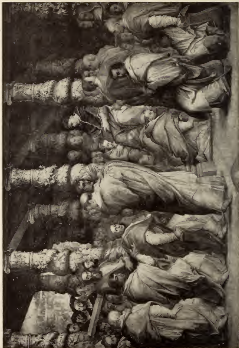
LEO X CREATES THIRTY CARDINALS